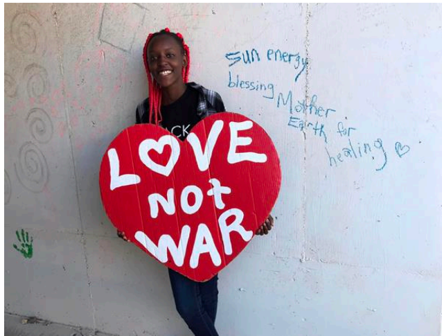
In the tunnels under Hwy 95, between Peace Camp and the Test Site