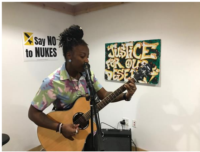
Vera for Love, singing for peace!