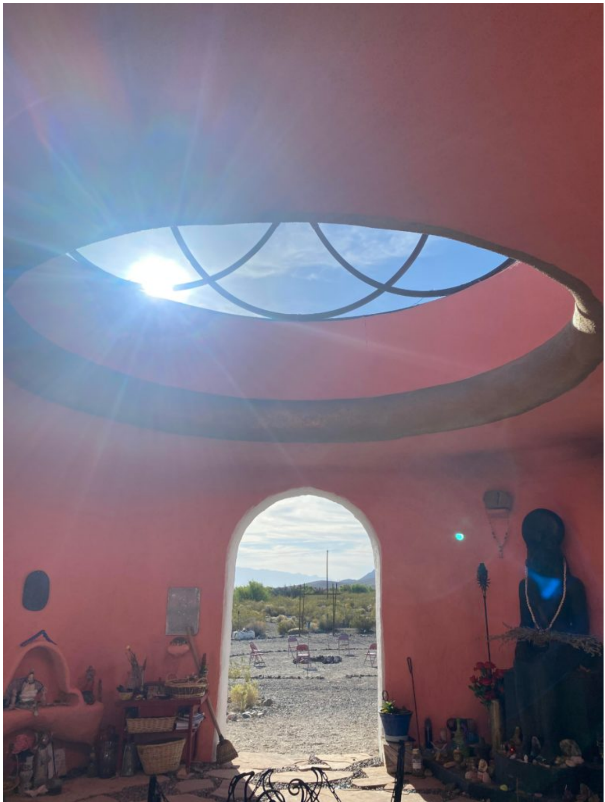
at the end of the weekend, Peace at the Goddess Temple